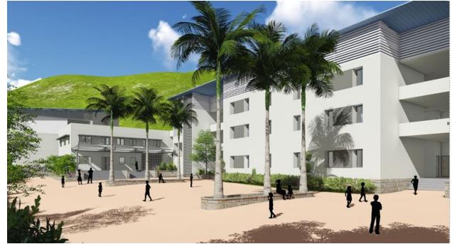
Primary Block Concept Drawing

For 2017, we will continue with final design drawings, site improvements, and fundraising. Interested in learning more about Hope Academy? http://www.hopeacademyvizag.org/about.html .